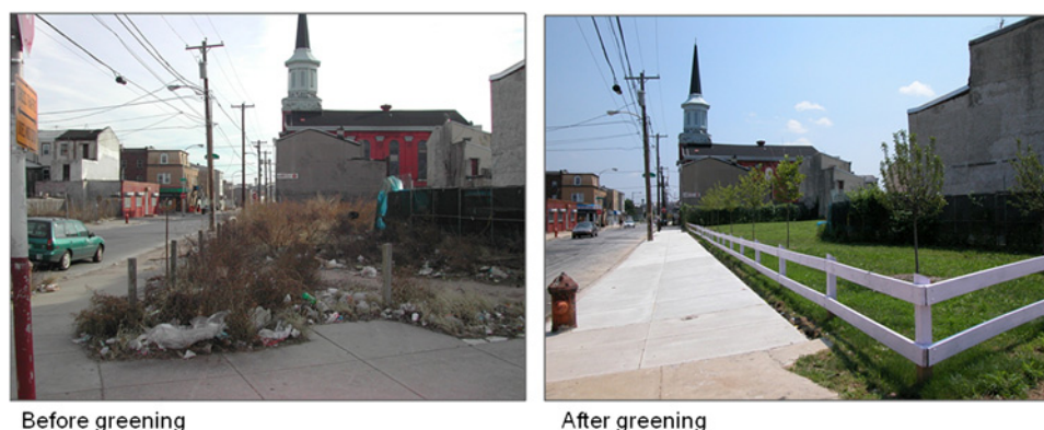
Figure 1 Before and after vacant lot greening by the Pennsylvania Horticulture Society.

Bureau of Revision of Taxes, the Philadelphia Department of Licenses and Inspections, and the US Postal Service records, and was maintained by the Cartographic Modeling Lab at the University of Pennsylvania. To be selected for randomisation, vacant lots had to meet the following eligibility criteria: (1) location in one designated section of the city (Philadelphia has a total of five geographic sections), (2) at least one city code violation, (3) no prior greening efforts by the PHS or the City of Philadelphia and (4) at least 4500 square feet of vacant lot space within a surrounding 660 square feet buffer. After exclusion criteria were applied to the master database, 2814 vacant lots remained. These vacant lots were randomly sorted and the top 50 served as index vacant lots. Index lots were grouped with other vacant lots in closest proximity to create 50 clusters each totalling 4500–5500 square feet of vacant lot space.